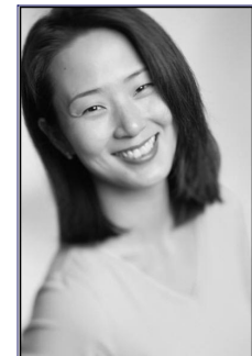
A smile makes the perfect first impression.

So if you have a desire to serve call us. You're already equipped—we'll train you in the rest and God will bless you for willingly saying “Here I am, send me”. Call 726-2677, do it now before doubts and excuses get in your way. You won't be sorry you did.