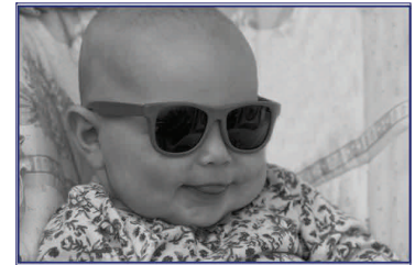
Stock gifts save lives, too!

If this is an option you would like to investigate, call Priscilla at 231-726-2677 and we see that you get in information you need to proceed.